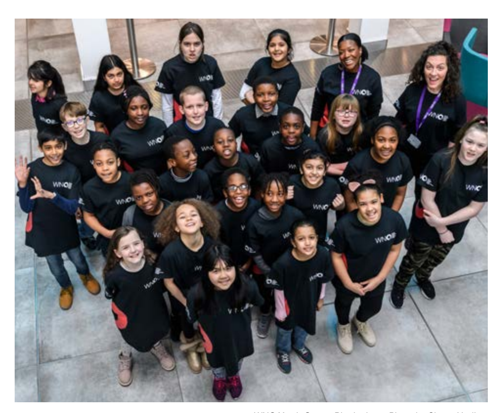
WNO Youth Opera, Birmingham.

Projects led in our West Midlands Hub have included regular work in primary, secondary and special schools; schools and family concerts including the development of a new concert for children and young people with PMLD; a project working with refugee families with young children; WNO Youth Opera for 8 to 14 year olds and a new arts and health initiative in hospitals and care homes. Delivery of these projects takes place across the week and includes evenings and weekends.