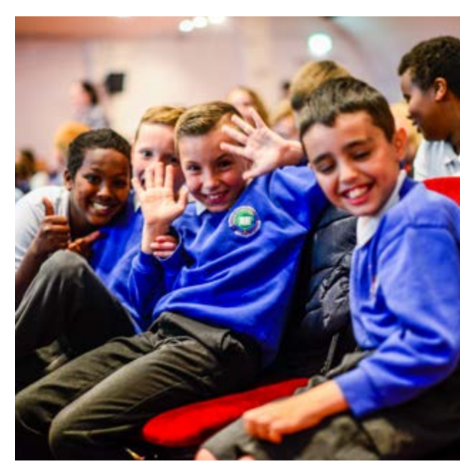
WNO Can Sing.