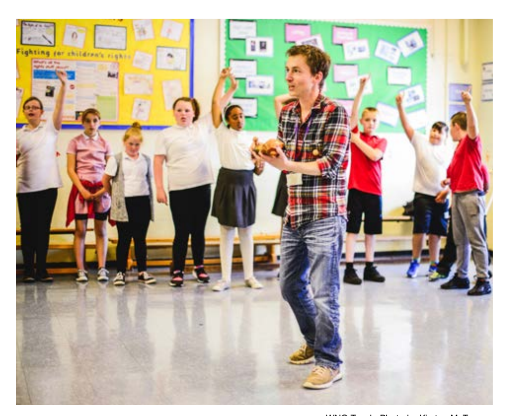
WNO Teach.

Welsh National Opera is an Equal Opportunities Employer and a Registered Charity. We encourage people from any background to apply for vacancies. We are committed to creating a workforce which is representative of society and brings together people with a variety of skills and experiences to help shape what we do and how we work. For this role we are particularly keen to hear from people representative of the varied ethnic groups living in the West Midlands.